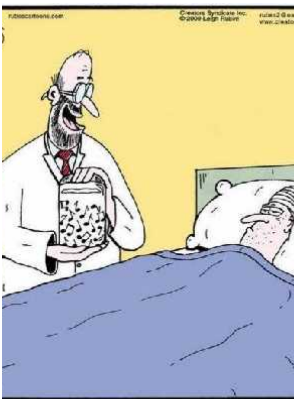
"Good news, Mr. Burgess. We've successfully removed the tune that was stuck in your head."