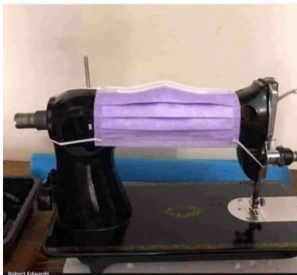
The masked singer.