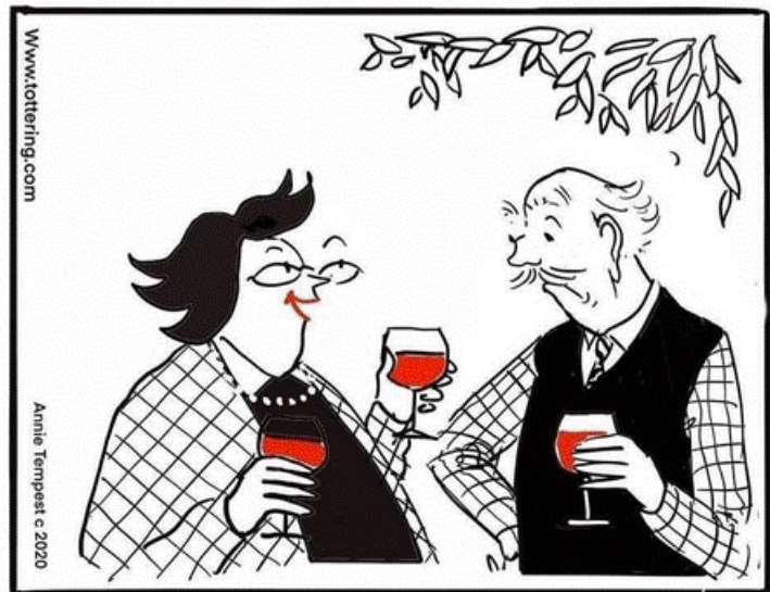
"It's just that I find that having two glasses of wine at once stops me touching my face..."