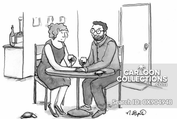
"Don't worry, I've been tested."