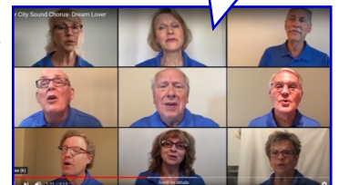
Examples of good camera positioning