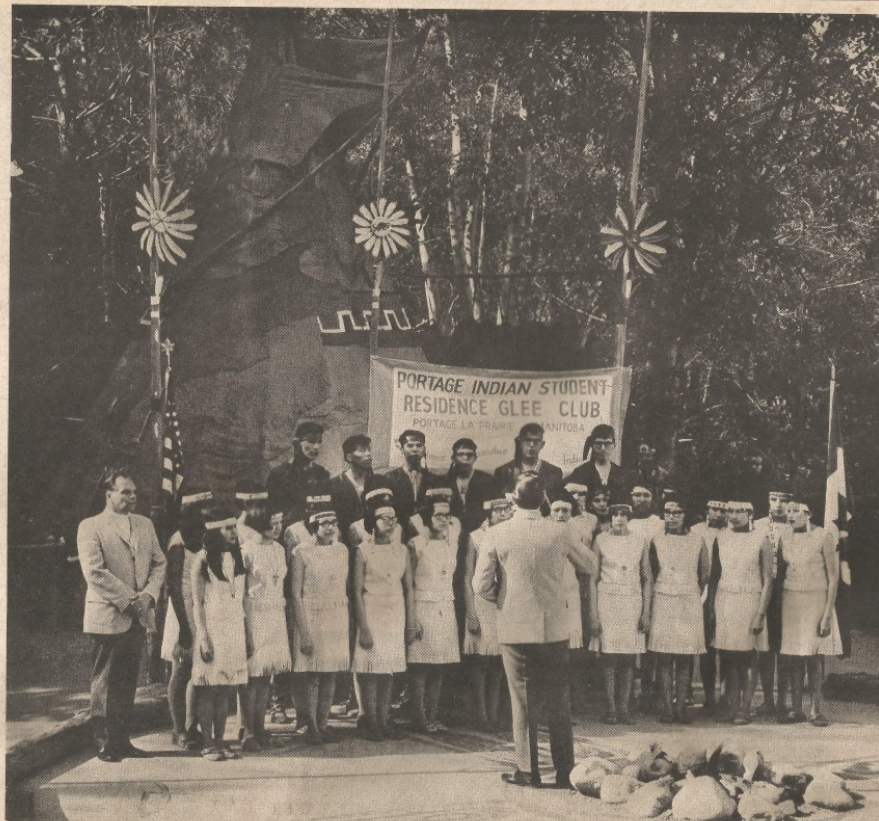
THE PORTAGE INDIAN CHORUS at Disneyland, Easter 1969.

Now the Glee Club has been invited to Expo 70 in Osaka, Japan. Their audience will be comprised of people from every nation in the world... but when the Portage students raise their voices they'll be singing in honor of home in celebration of Manitoba's Centennial Year.